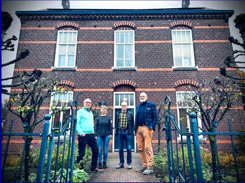
Health-Care centre LaefHoês Village America (2200 inhabitants)