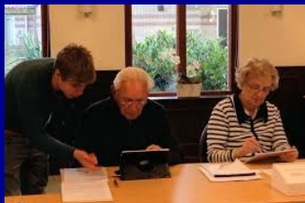
Increase of self-reliance