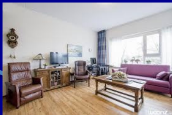
Housing with care