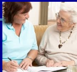
Info & Advise