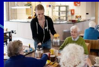
Active citizens / volunteering